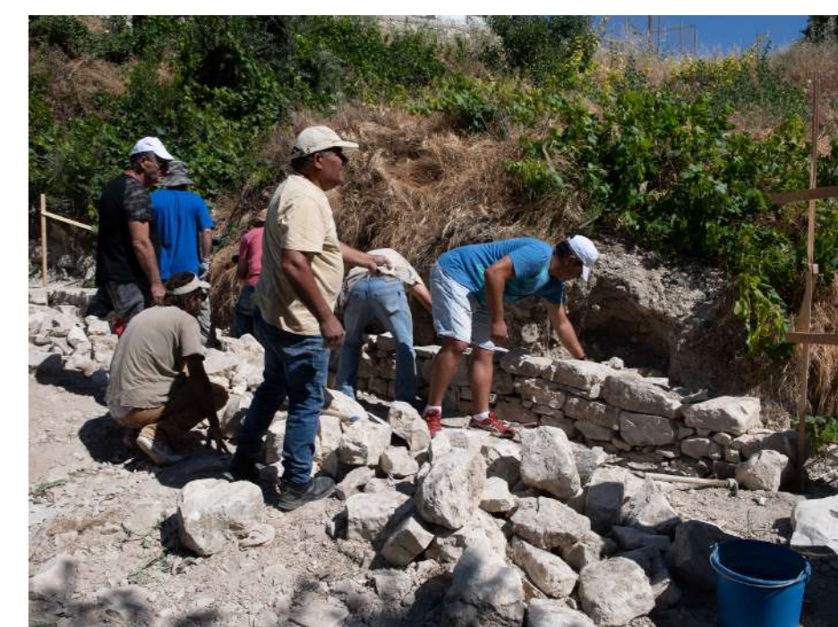
Drystone maintenance workshop, Vasa Koilaniou