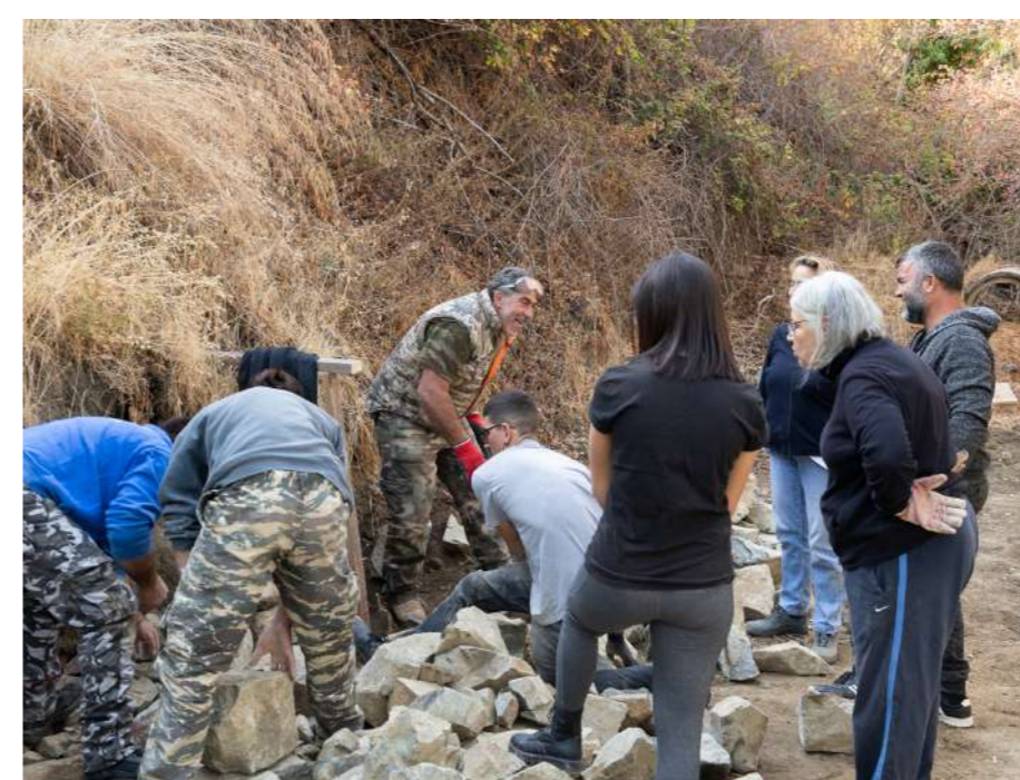
Drystone maintenance workshop, Polystipos