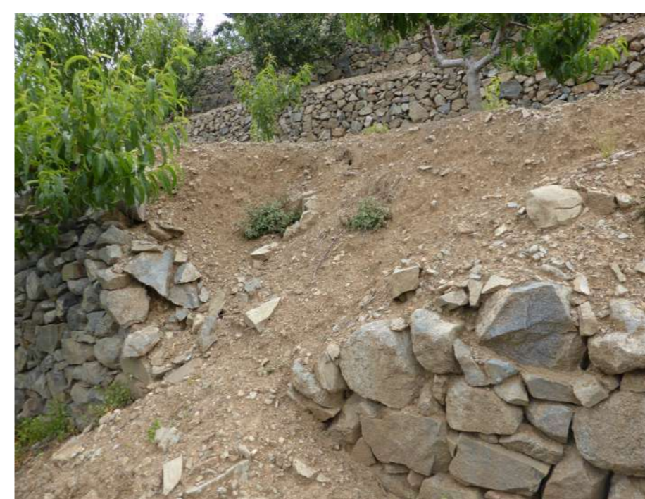
Soil erosion in collapsing drystone terraces, Agros.