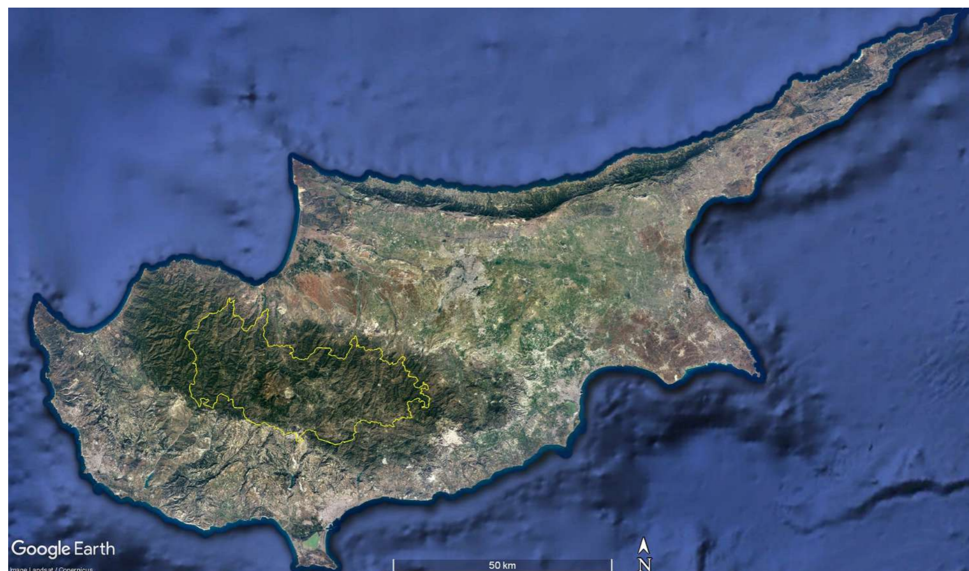
Localization in Troodos Mountains, located roughly in the center of the island of Cyprus. Troodos is the largest mountain range in Cyprus, stretching across a third of the island.