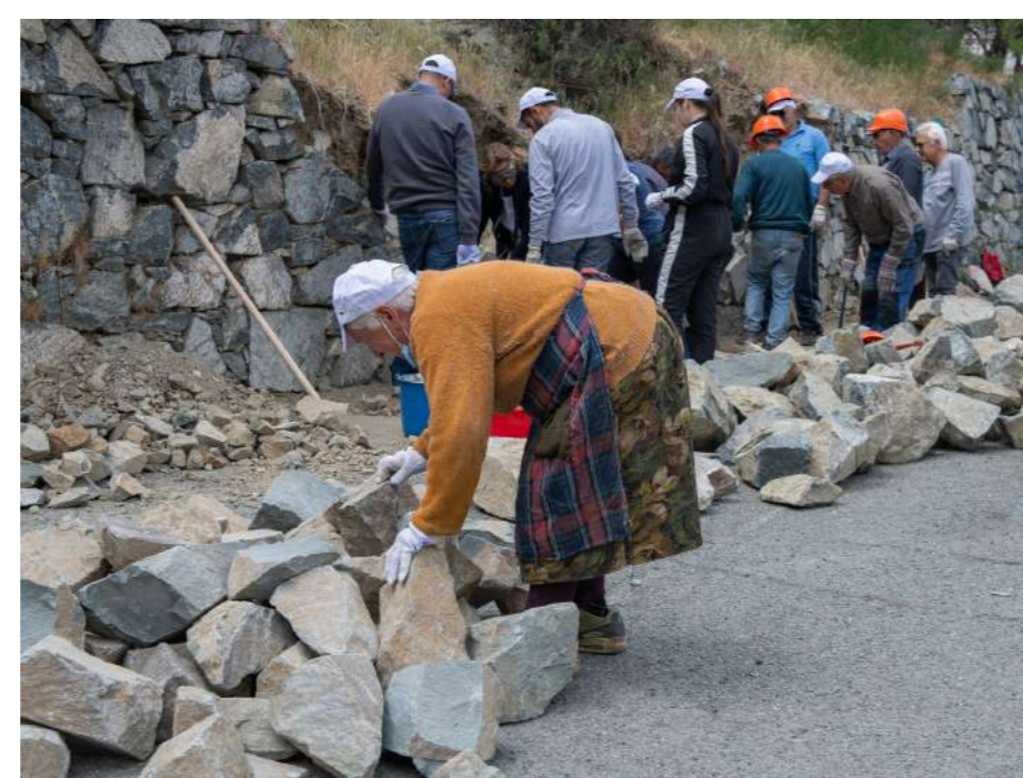
Drystone maintenance workshop, Alona