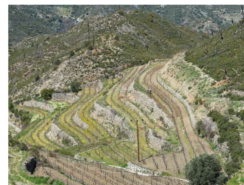
Mountain Terraced Vineyard, Pelendri.