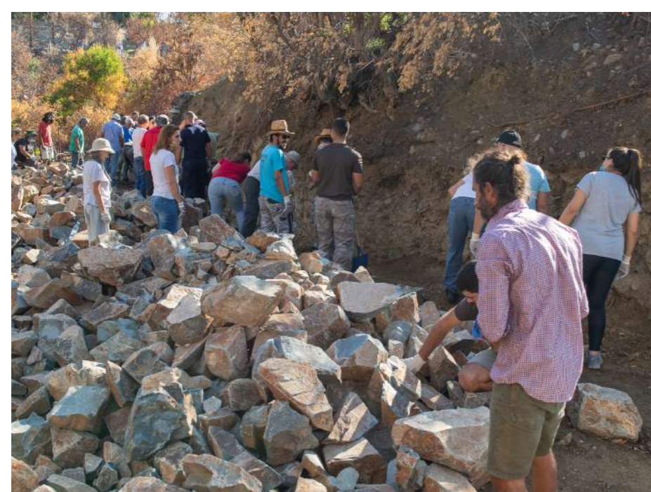
Drystone maintenance workshop following fires, Ora