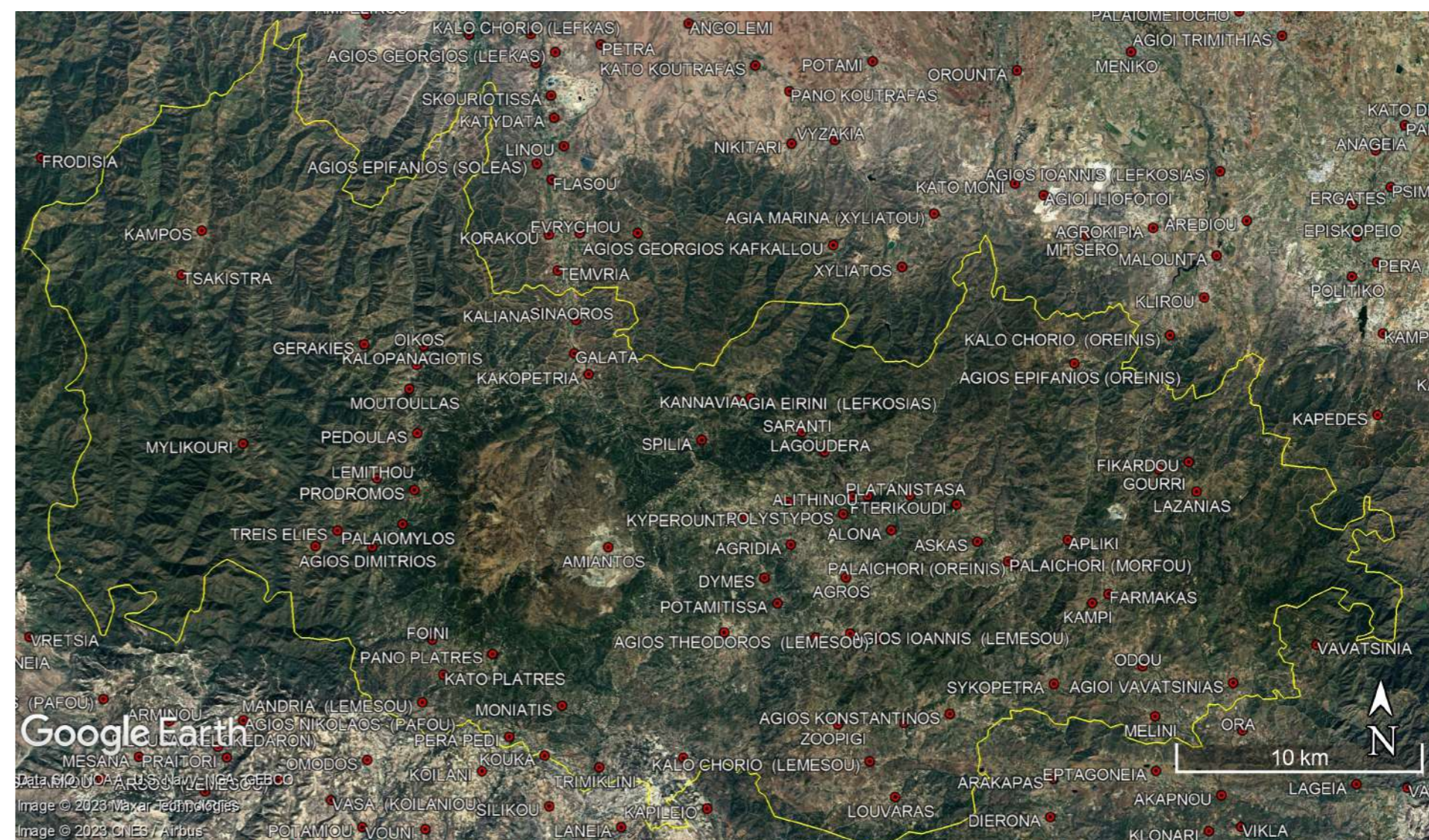
Areal Google Map View of Troodos Mountains and surrounding scenic villages. Delineation of Troodos mountain, Cyprus.