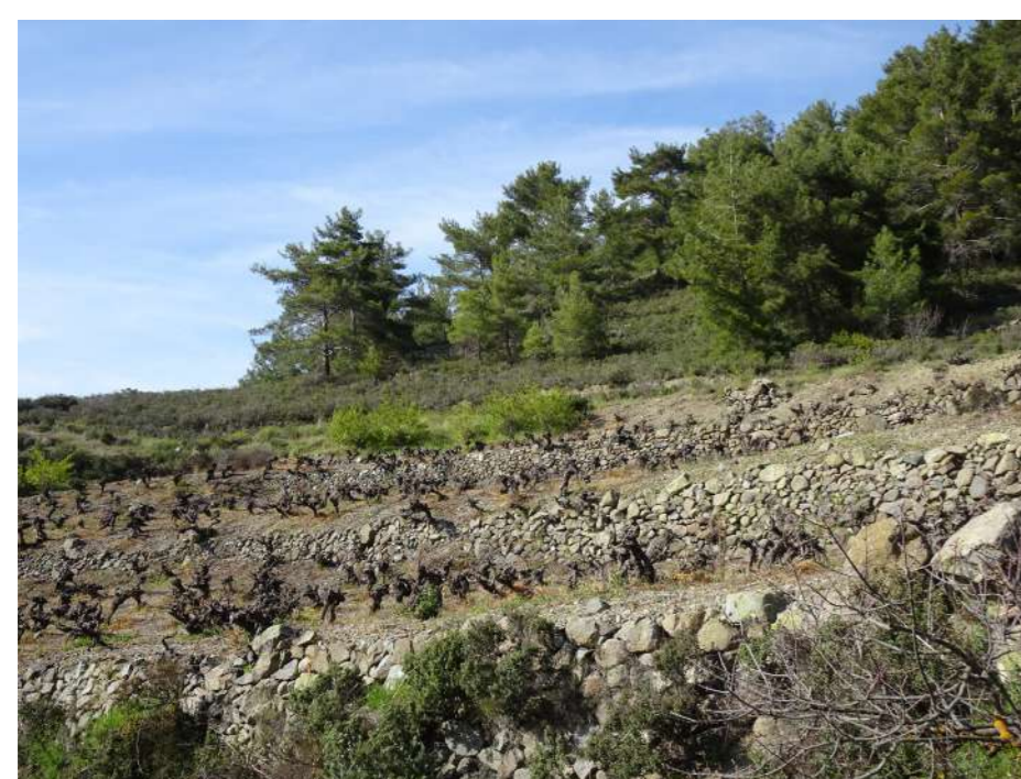
Traditional mountain terraces with grapes.