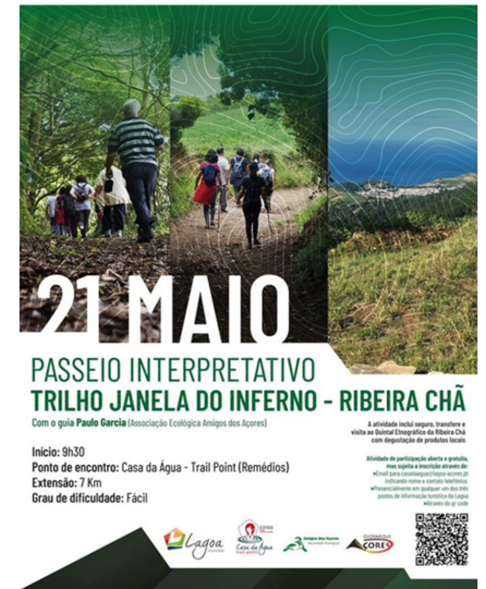
Poster of Janela do Inferno trail activity on 21 May