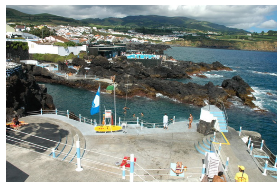
Lagoa - natural pools. https://www.guiadacidade.pt/pt/poi-piscinas-municipais-da-lagoa-rosario-18526