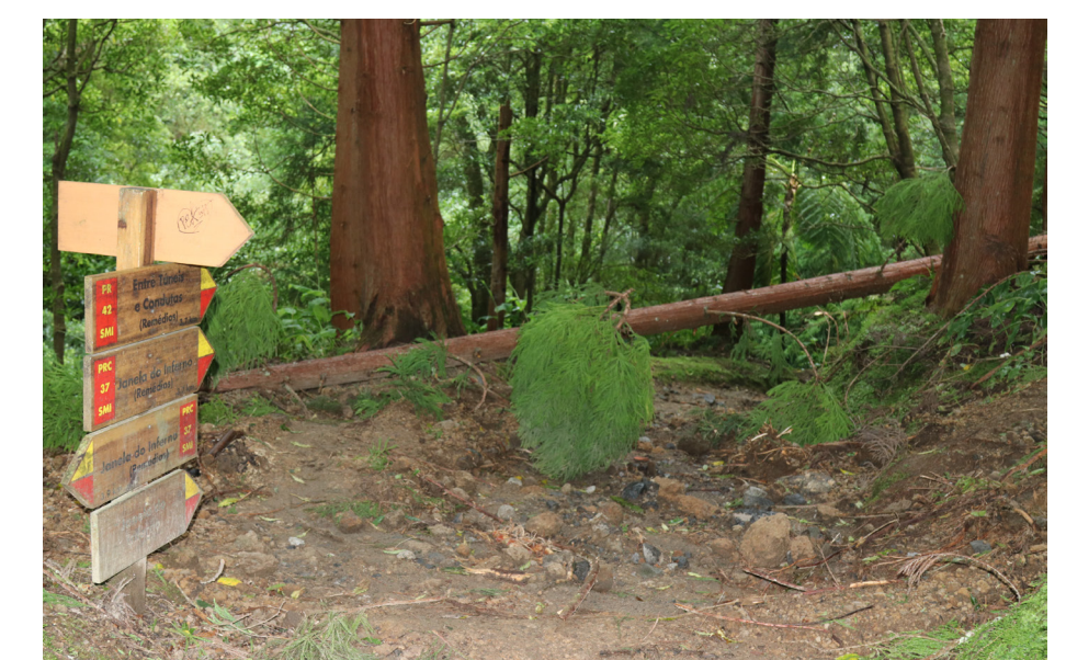
Janela do Inferno Trails