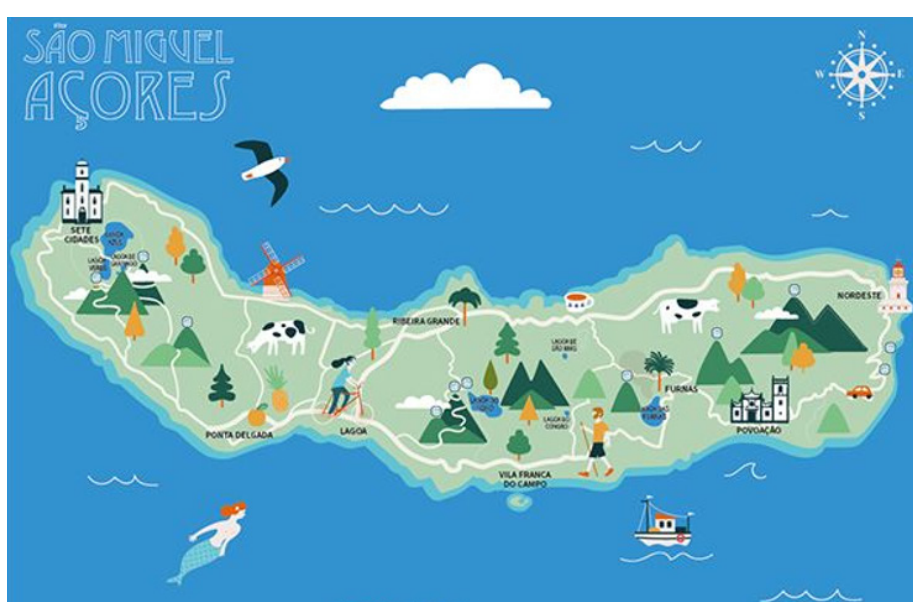
Localization in São Miguel, map of trails