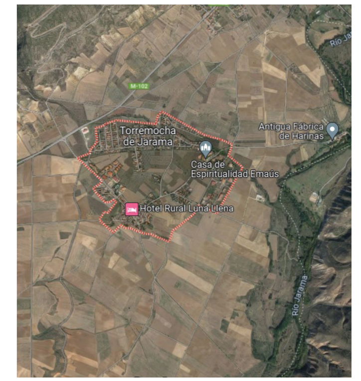
Areal Google Map View of Madrid Rural Area