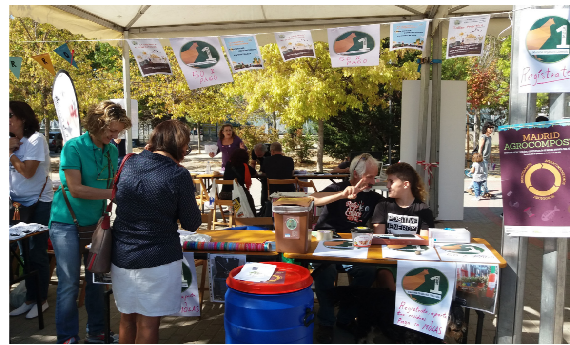
La MOLA Market