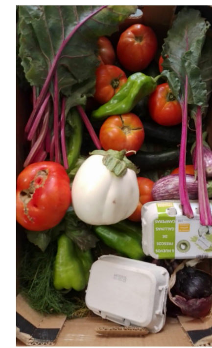
CSA Basket of vegetables