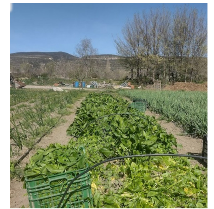
Urban Vegetable Garden