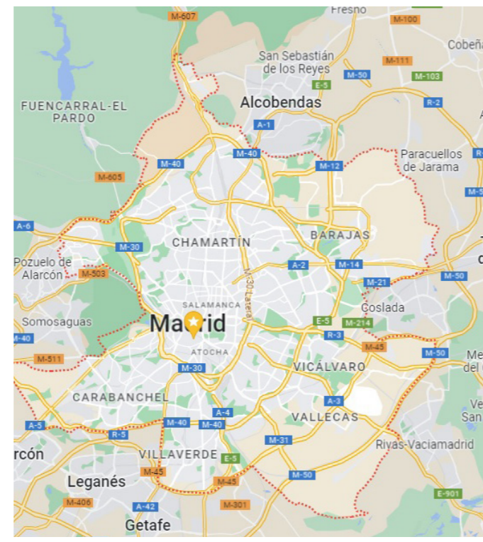
Localization of Madrid Urban Area