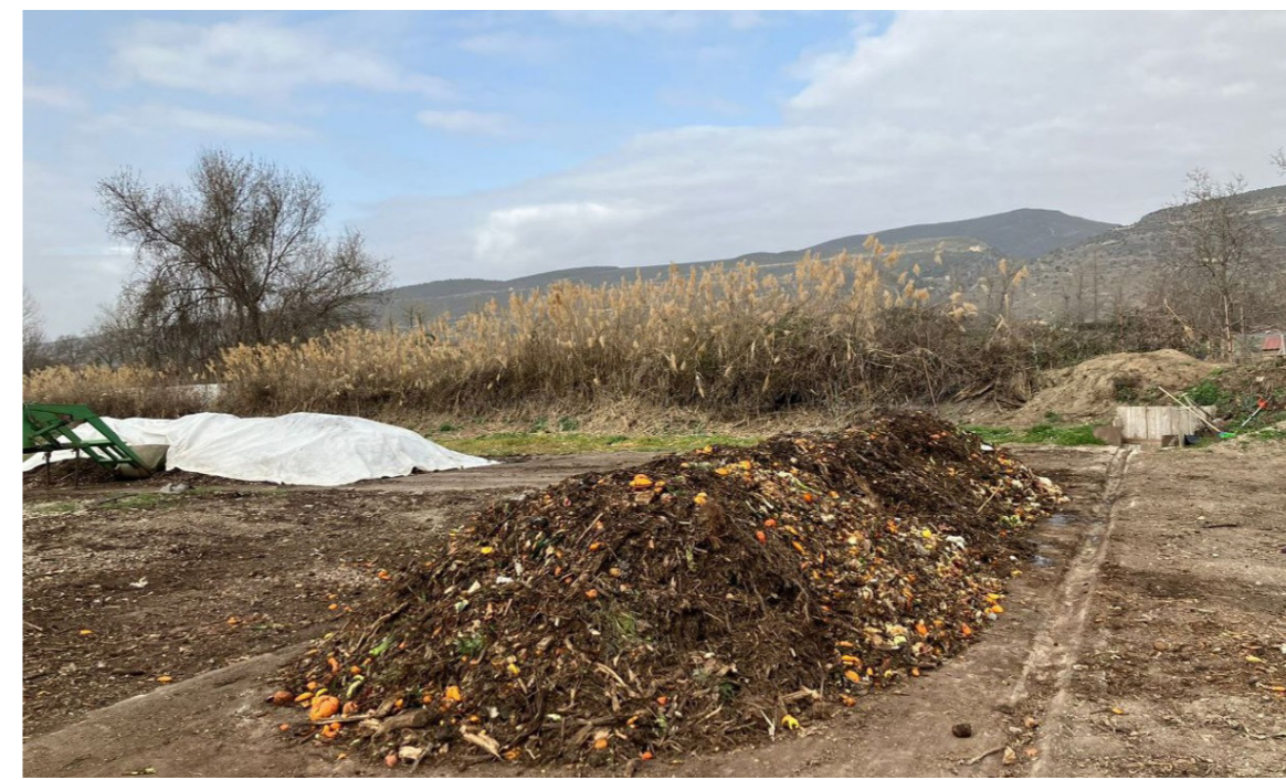
CSA Composting Pile