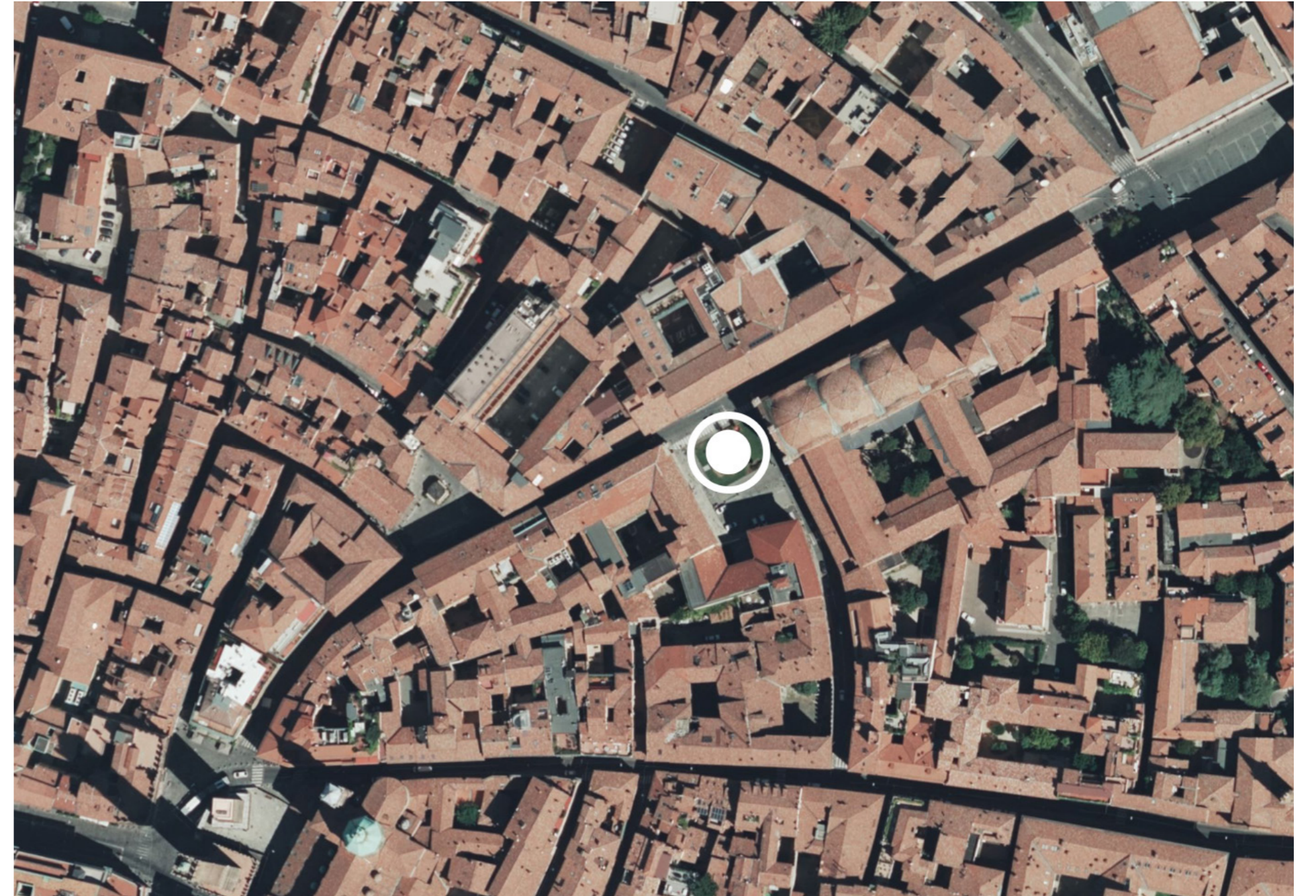
Areal Google Map View of Piazza Rossini