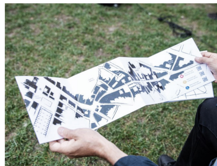
Students engaged in the tactical urbanism action in Piazza Rossini.