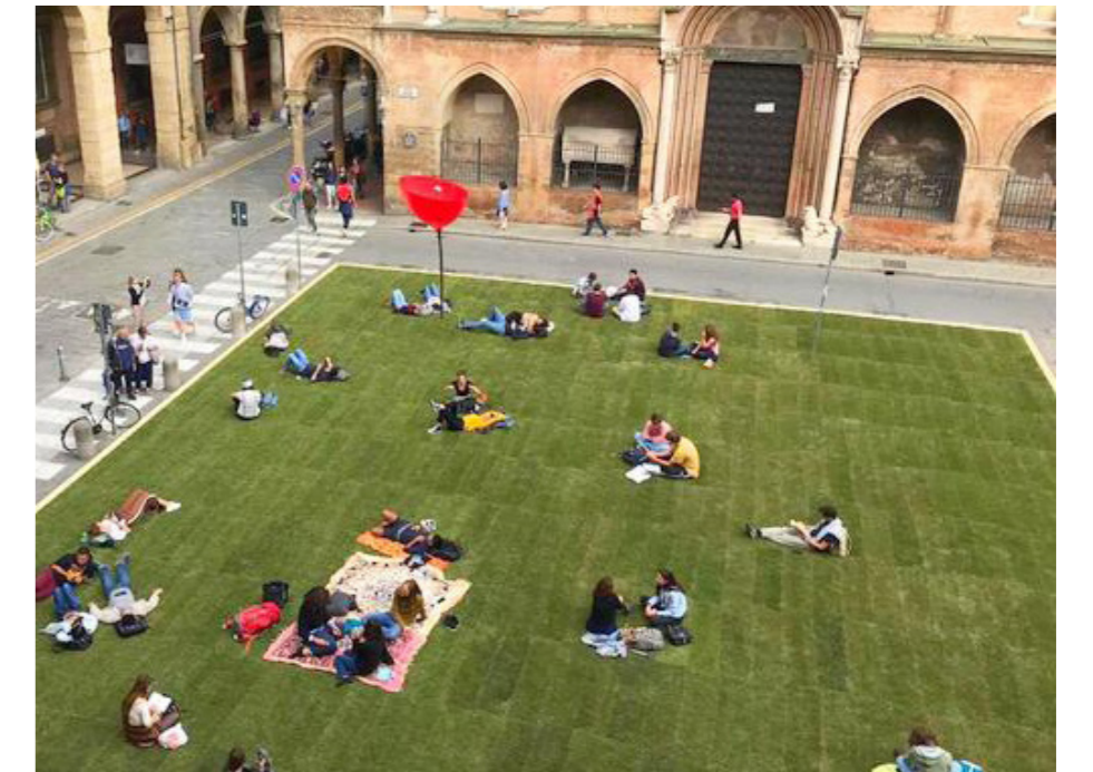
Piazza Rossini used by the community after the Tactical urbanism action.