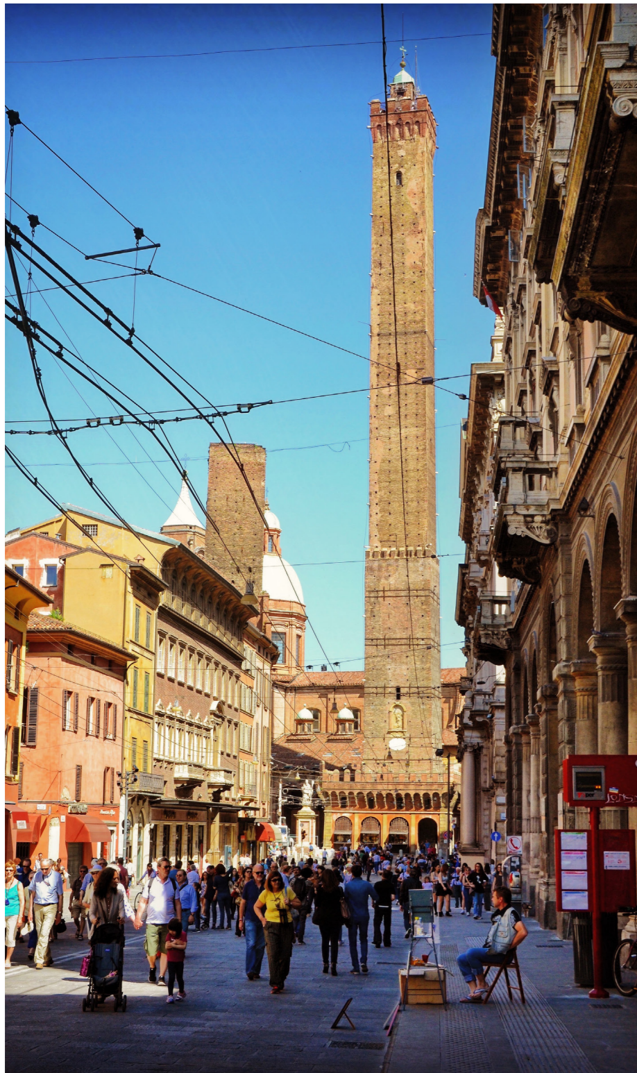
Via Zamboni, one of the main street of the city centre of Bologna.