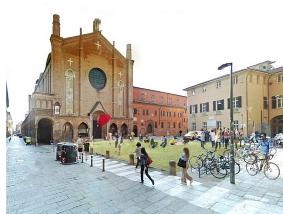
Piazza Rossini used by the community after the Tactical urbanism action.