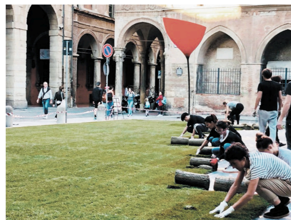
Five square workshop exploration in Bologna.