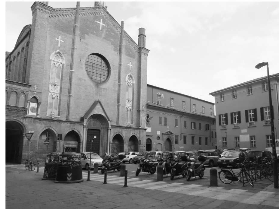
Piazza Rossini used as a parking lot before the transformation.